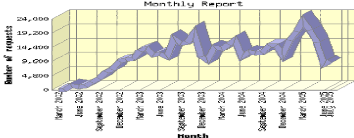
Living Word Broadcast - Website Usage Statistics - Summary by Month Generated on July 31, 2005 11:59 PM Central Standard Time